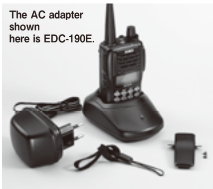
Shown with standard accessories