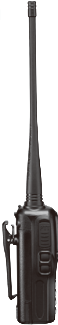
shown with EBP-87

5 : Dust protected /Ingress of dust is not entirely prevented, but it must not enter in sufficient quantity to interfere with the satisfactory operation of the equipment; complete protection against contact 4: Splashing water / Water splashing against the enclosure from any direction shall have no harmful effect. Test duration: 5 minutes / Water volume: 10 litres per minute /Pressure: 80-100 kN/m 2