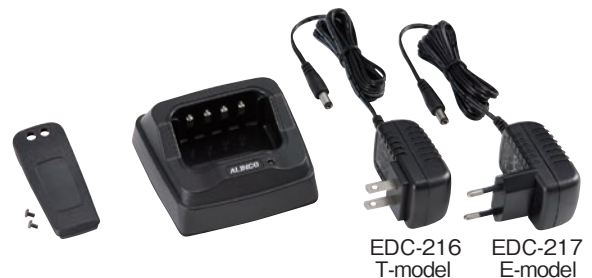
EDC-216 T-model EDC-217 E-model

Standard accessories declared herein are our factory default and may vary at moment of sales depending on the market and Dealers' sales policy.