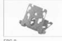
EBC-8 Front Control Panel Bracket