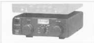
EDX-1 Manual Antenna Tuner