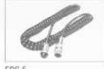
EDS-5 Microphone Extension Cord