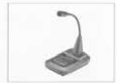
EMS-14 Desktop Microphone