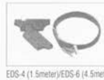
EDS-4 (1.5meter)/EDS-6 (4.5meter) Front Control Remote Cable