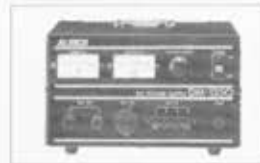
DM-1350T (120V AC) DM-1350Z (220V AC) Regulated DC Power Supply