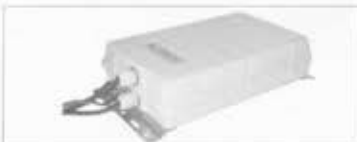
EDX-2 Automatic Antenna Tuner