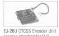
EJ-26U CTCSS Encoder Unit (comes standard for U.S. Version DX-70T)