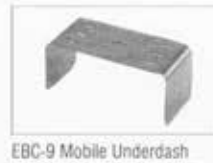
EBC-9 Mobile Underdash Bracket (for DX-70/EDX-1)