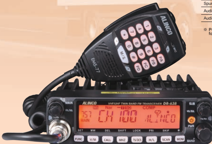
Mobile/Base VHF+UHF FM Transceiver