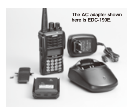
Shown with standard accessories

Standard accessories declared herein are our factory default and may vary at moment of sales depending on the market and Dealers' sales policy.