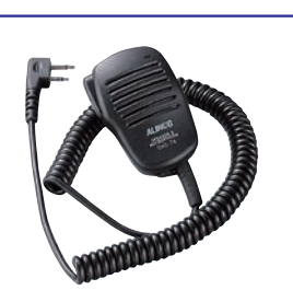
Speaker Microphone (EMS-76)