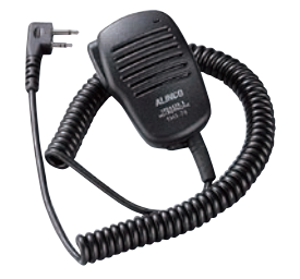
Speaker Microphone (EMS-76)

Alinco and ALINCO logo are registered trademarks of Alinco Incorporated, Japan in the United States, EU States, Russia, China and many other countries. All other trademarks are the properties of their respective holders.